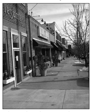
Edgewood residents enjoy the diversity and convenience of South Braddock Avenue businesses. Soon they will also enjoy a newly paved route to them.

Part of this project will include improving the storm sewer system on Mifflin Avenue and paving that specific project area and we will be adding about 200 feet of storm sewer pipe on Railroad Alley and paving that project area as well. Railroad Alley has been sinking for quite some time so this is a much-needed improvement.