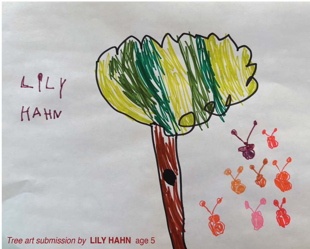
Tree art submission by LILY HAHN age 5

ECRWSS POSTAL CUSTOMER PITTSBURGH, PA 15218